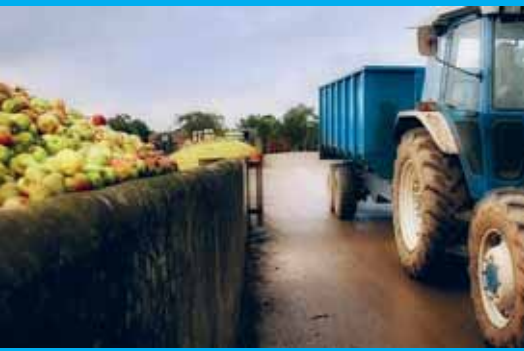
H Weston & Sons supply us with ciders in the UK.