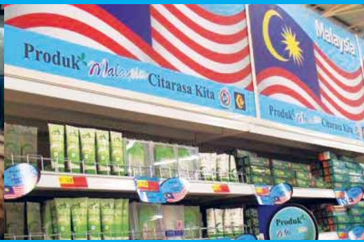
Local products on sale in Malaysia.