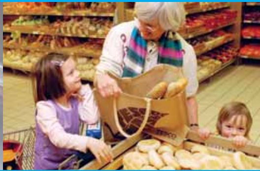
Locally made bread in the Czech Republic.