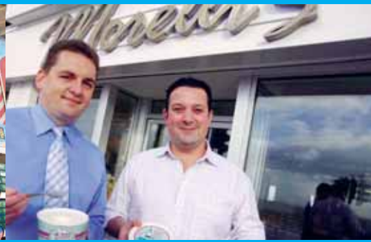
Morelli's ice cream supplying our stores in Northern Ireland.