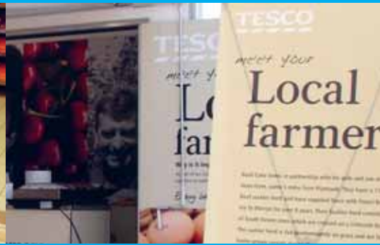
'Meet your local farmer' event in the UK.

We were the first supermarket to appoint a Code Compliance Officer in 2005 to act as a contact point for suppliers. It enables suppliers to escalate their complaints on a confidential basis. We welcome the Competition Commission recommendation that all supermarkets appoint such an officer in future.